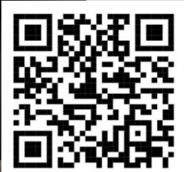
Scan to download the app